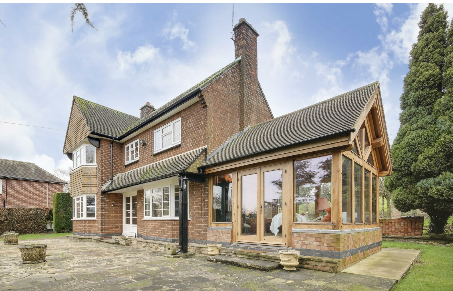
Honeyknab Lane, Oxtun, Nottinghamshire NG25 0SX